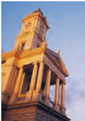
Ballarat Town Hall