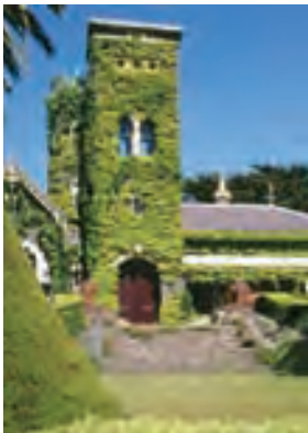
Narrapumelap homestead, Wickliffe