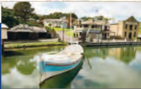
Warrnambool Maritime Museum